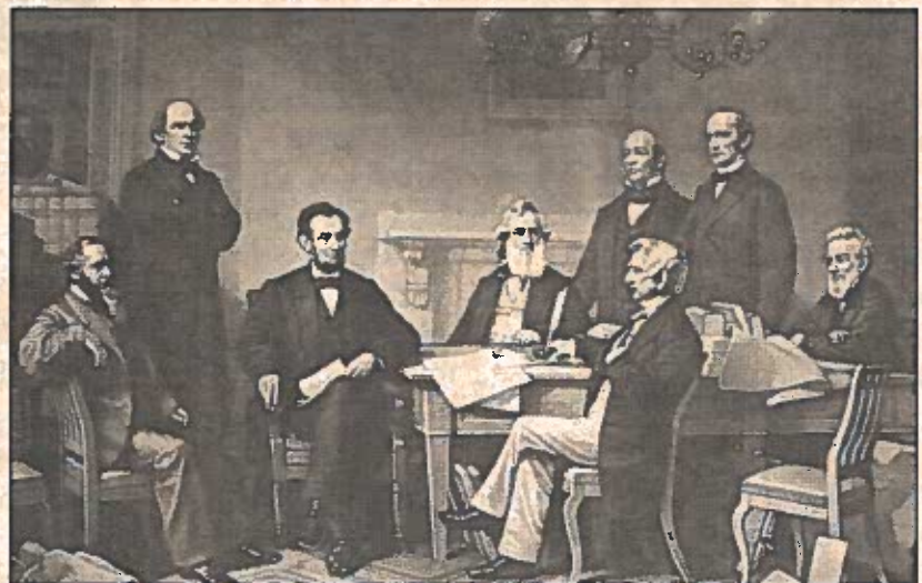
Abraham Lincoln reading the Emancipation Proclamation

And yet, Connecticut gave rise to abolitionists and those who helped slaves reach freedom along the Underground Railroad. Although the secrecy of sites makes it difficult to fully document which homes and buildings were used in the Underground Railroad it's believed there was a stop on Ladder Hill Road. ☪