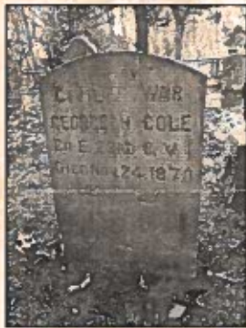
Civil War Tombstone

T here were 21 Westonites who fought and died during the Civil War. Ultimately the war ended slavery and preserved the Union.