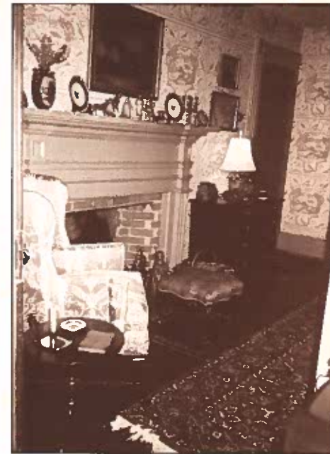
Two views of the front parlor at 1 The stool in front of the fireplace has be