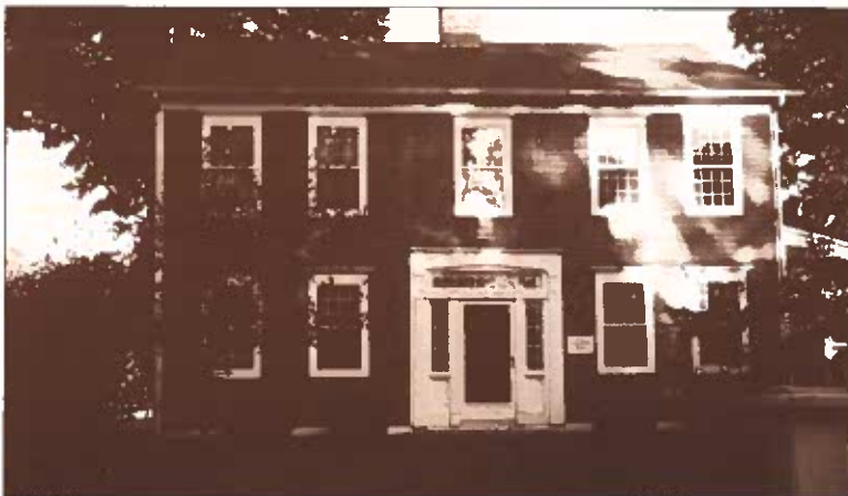
Samuel Merwin Banks House, 227 Lyons Plain Road