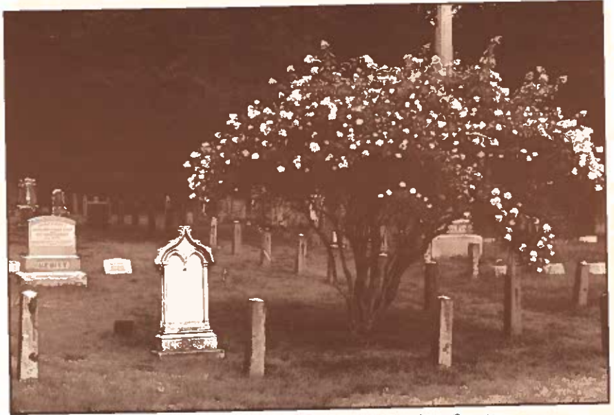
Hydrangea located near the Coley family plot at the Coley Cemetery

town of Fairfield. Prior to 1900 the cemetery is referred to as the "old burial ground." After 1900 there is a reference to the "Kettle Creek Cemetery" or "Norfield Cemetery." In 1924 the reference became the "Coley Cemetery" which it is still called today. After much research of town records, however, no evidence was given that the ownership of the cemetery was by the Coley family.