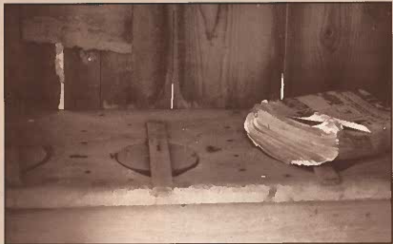
Photographer found 1930's catalog still in place on the seat of this old outhouse.