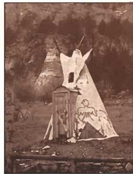
These Texas roadside Teepee privies for