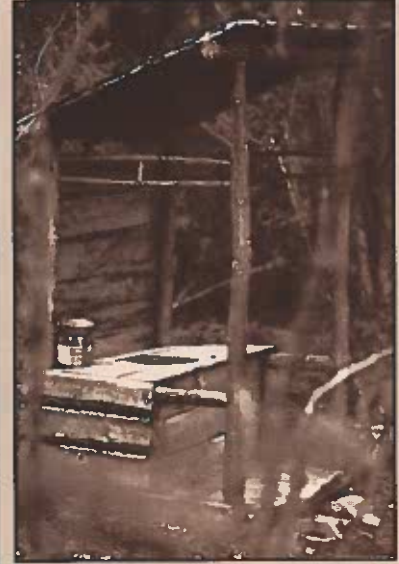
Alaska has more outhouses than any other state in the Union