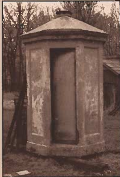
Victorian public park privy, (panelled door has been covered.)