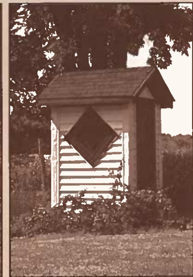
This outhouse was the recent victim of an aluminum siding salesman.

"The Vanishing American Outhouse" reprinted with permission of the Windmill Publishing Company.