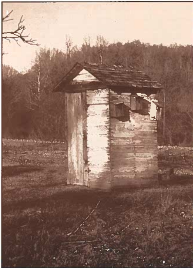
Birdhouses were privy status symbols often set on rooftop poles.