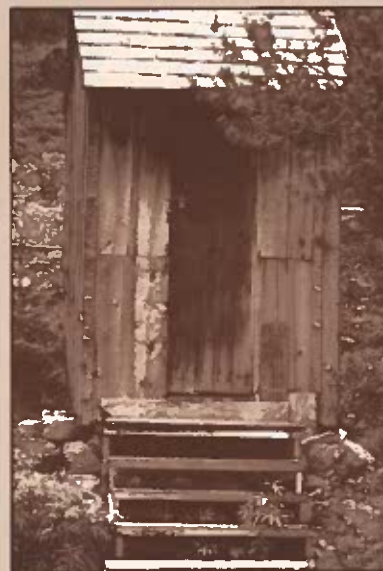
Transplanted Colorado privy now serves as an attractive tool shed.