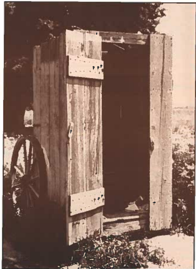
Portable privy for field workers on a Morrisville, PA farm.