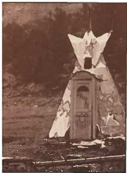
is" and "Squaws" are traffic stoppers.