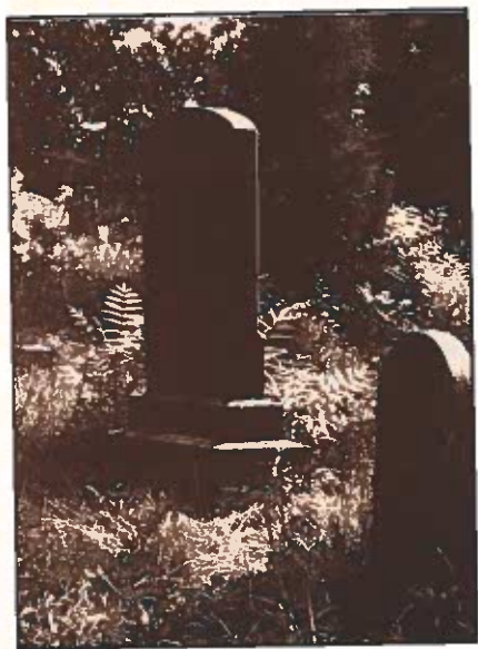
Headstones in Coley Cemetery before the cleanup

Some interesting details were brought to the committee meeting on July 10, 1991 by Maryann Root, title searcher. It was reported that a cemetery for undesirables would normally have been about 10 miles from the center of town, which leads to the possibility that it may have been originally from the