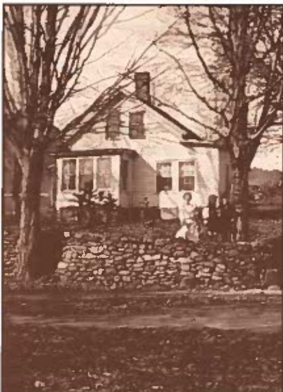
Home of Charles Keene located at the north corner of Weston Road and Broad Street - visible in front of stone wall (circa 1910)