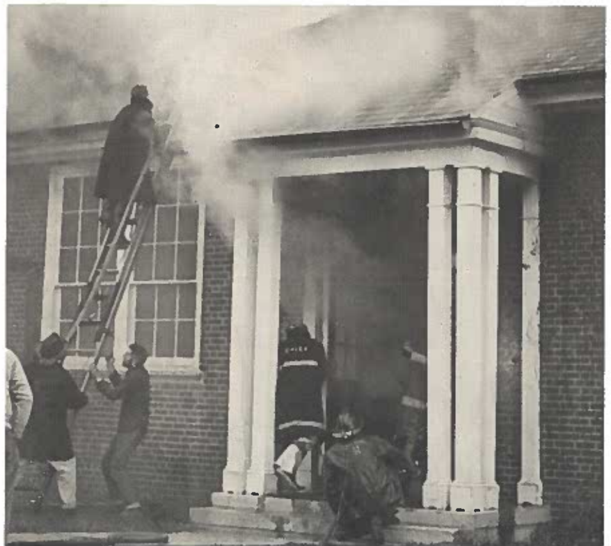
Up In Flames - As smoke engulfed Hurlbutt School on Oct. 30, 1963, volunteer firemen wrestled with hoses and ladders to fight the blaze that destroyed the building.

By 1937, the school population had grown so much that an addition was needed. At a meeting in 1938, the town