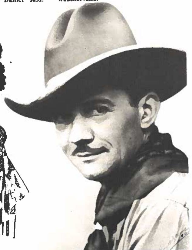
John Held, Jr. (undated).