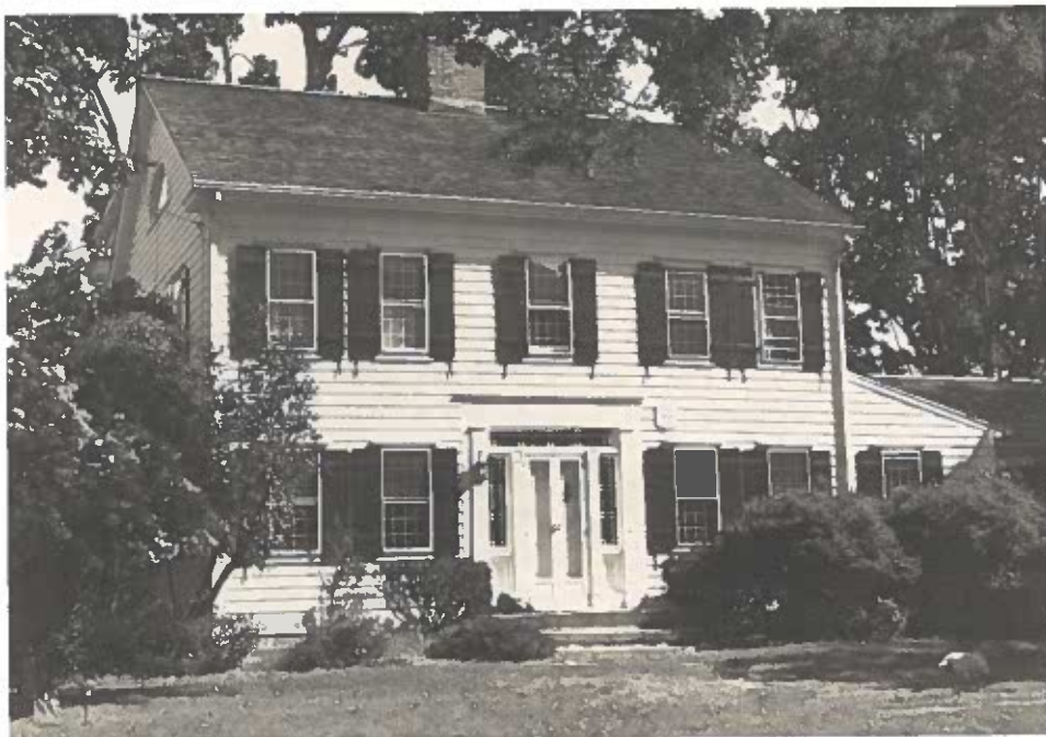
The Wakeman Godfrey House, 1831.

The first step in a building report is to study the location of the house. Land that became the town of Weston was originally common land owned by inhabitants of Fairfield. In 1671, the common land was divided among the inhabitants, who created long lots