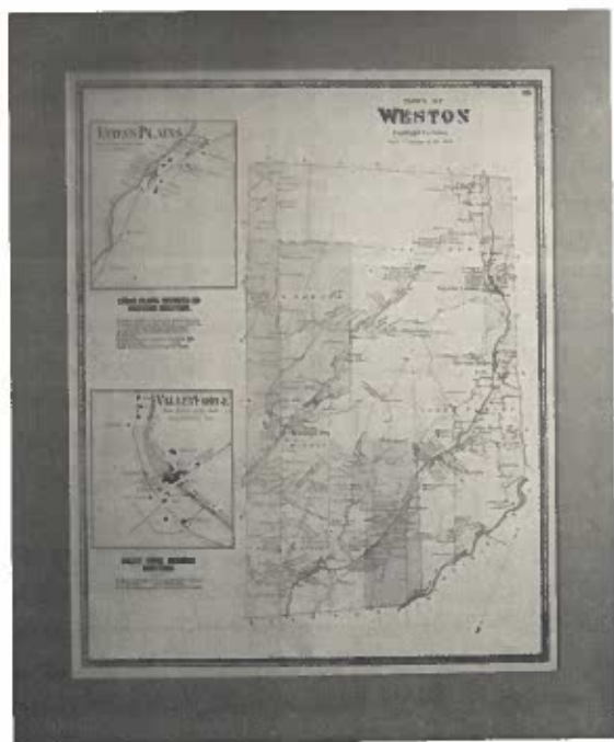
The Beer's Atlas, 1867

The Godfrey House is a splendid late-Federal house, with centered doorway and windows, five-over-four. The gable ends, which are returned about 18