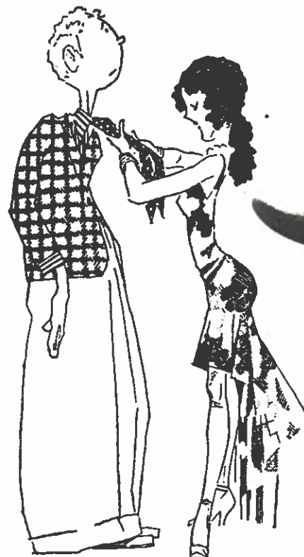
"THEY WANT TO FIX YOUR TIE"